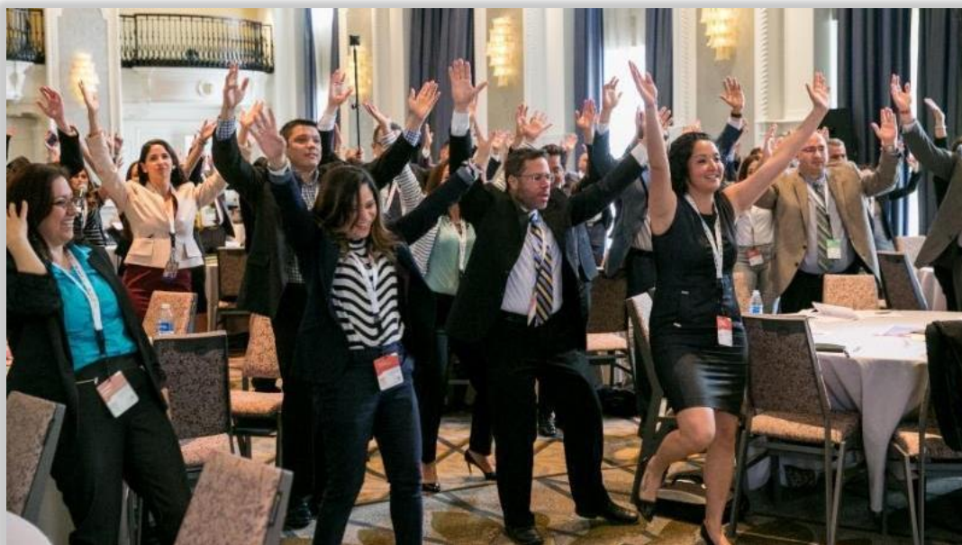
Corporate Achievers from the Hispanic Association of Corporate Responsibility