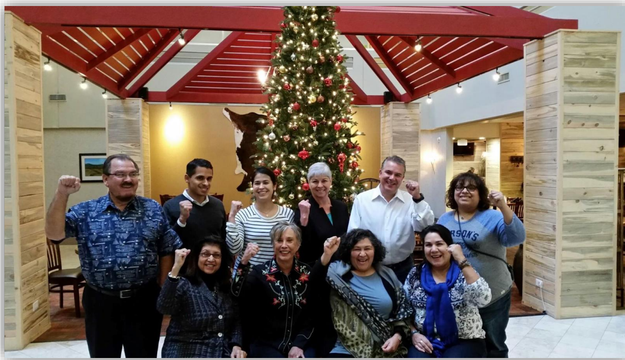
December 2015 The Lideramos Story begins – Initial meeting in Denver, Colorado