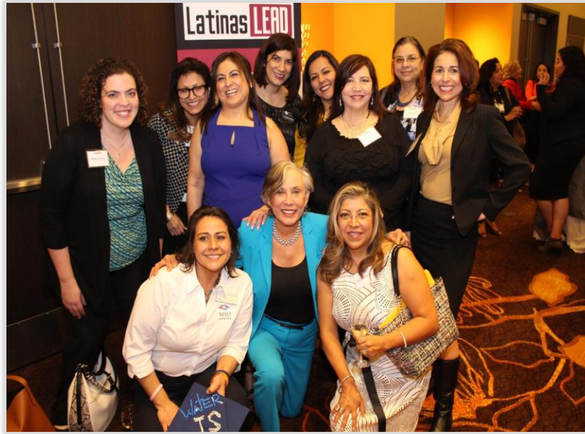
Denver's Circle of Latina Leadership Graduates

TYPE OF PROGRAM: COMMUNITY NON-PROFIT/UNIVERSITY