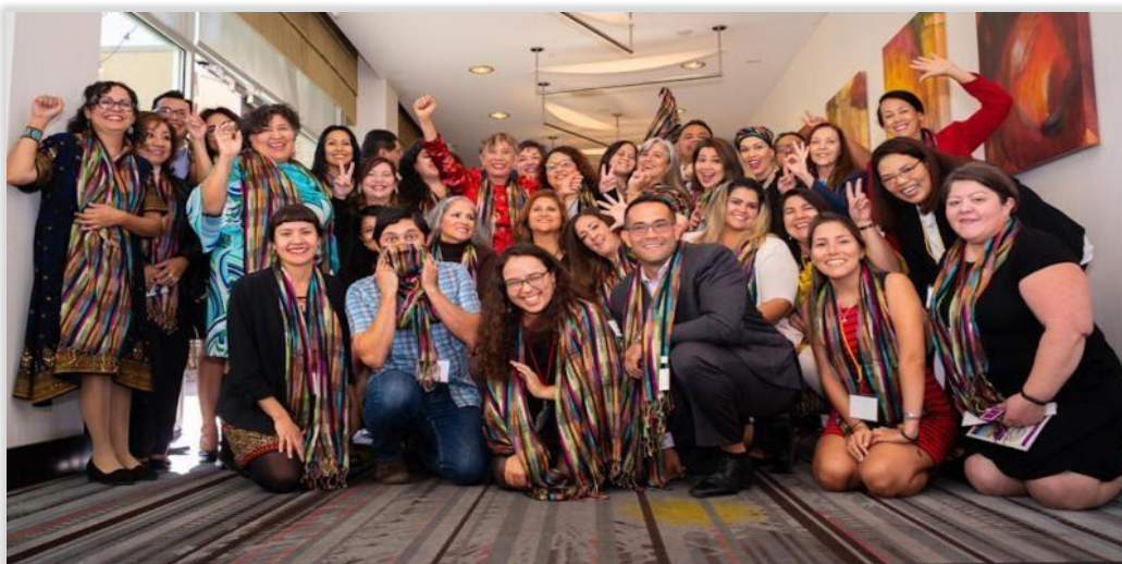
2018 Lideramos Symposium: Promoting Community, Culture, and Civic Change

Program Description: The Latino Nonprofit Leadership Academy (LNLA) was created in 2006 to support emerging and existing leaders of Latino-led and serving organizations, and to strengthen their capacities. LNLA goals were to: (a) close significant capacity-building needs not covered by traditional leadership development; (b) introduce state-of-the-art thinking about nonprofit leadership and management; (c) reinforce expertise, sustainability and magnitude of scale among Latino nonprofits; (d) connect and strengthen local Latino nonprofits to develop cross-collaboration to impact statewide systemic change; (e) augment data-collection and data analysis; and (f) support Latino nonprofits' excellence. A total of 10-20 Latino-led and serving nonprofits participated in each Academy. Each 12 month Academy consisted of three residential 2 ½-day Workshops; on-site technical assistance; distance learning; peer-to-peer consulting; and coaching. TCLI assembled a culturally relevant team of experienced and highly regarded Latino nonprofit leaders.