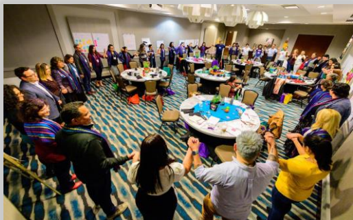
Latino Leaders at 2019 The National Latino Leadership Symposium - Demonstrate their Unity, Commitment, and Resolve

Program Description: The Superintendents Leadership Academy recruits and prepares school system leaders to become school districts superintendents with an emphasis on Latino serving districts. The yearlong leadership training Academy includes coaching and mentoring by high-powered, successful practitioners. Areas of study include: leadership, governance and strategic planning, curriculum alignment, instruction and student assessment, characteristics of equity leadership, community engagement, management systems and structures, and preparation to become a superintendent.