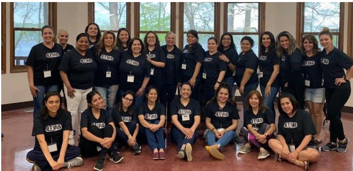
The Inaugural 2019 Class Empowering Latina Leaders and Advocates for Success – ELLAS - Kalamazoo, Michigan. ELLAS is the first leadership program initiated with support, technical assistance and training from Lideramos